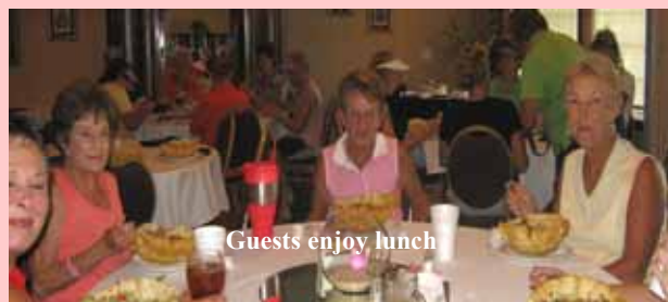
Guests enjoy lunch