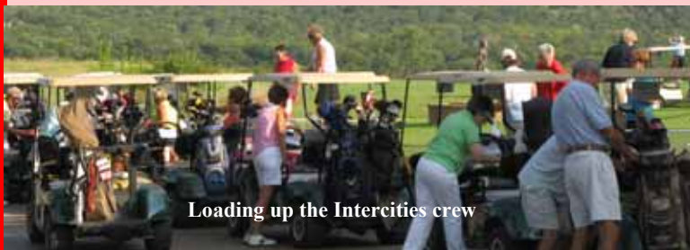
Loading up the Intercities crew

The Runaway Bay Ladies Golf Association hosted the women's Intercity golf event on August 19th. Twenty-six golfers from several area clubs had a great day of golf despite the 100°+ temperature. That made enjoying lunch in the cool and comfortable Roosevelt Room even better. The Runaway Bay LGA was represented by 9 golfers and several of our Associate members joined us for lunch. Thanks to everyone who made this a very successful day.